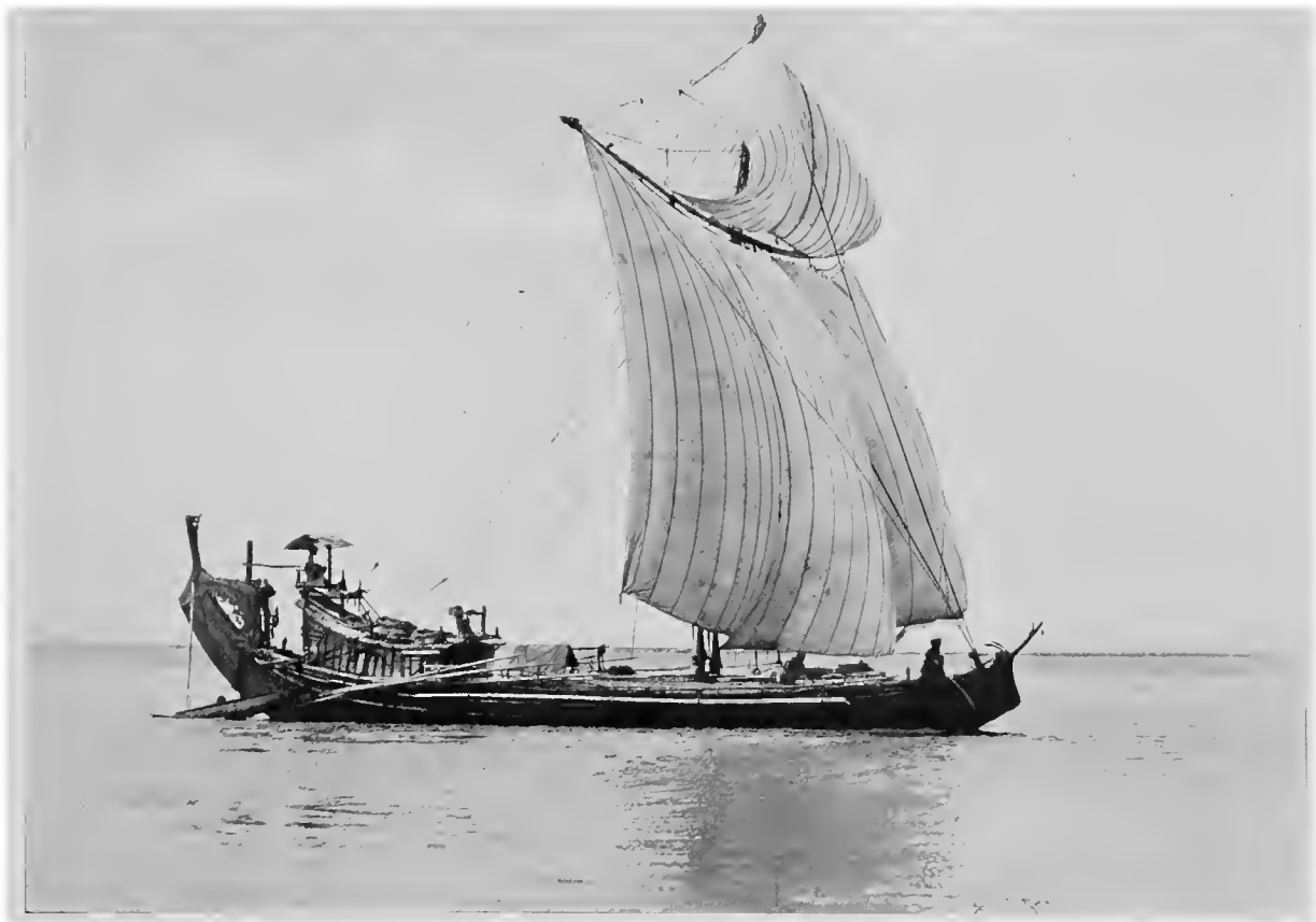
Burmese Cargo Boat on the Irrawaddy